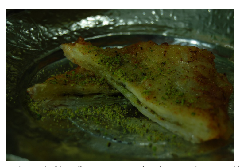
Figure 3: Photograph of the Güllaç Kızartma Dessert from the nineteenth century cookbook, prepared in our time.

It is taken out with a colander, left in boiling syrup immediately, and turned and placed on the plate when the other side is sufficiently syrup.